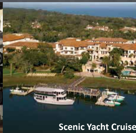
Scenic Yacht Cruise