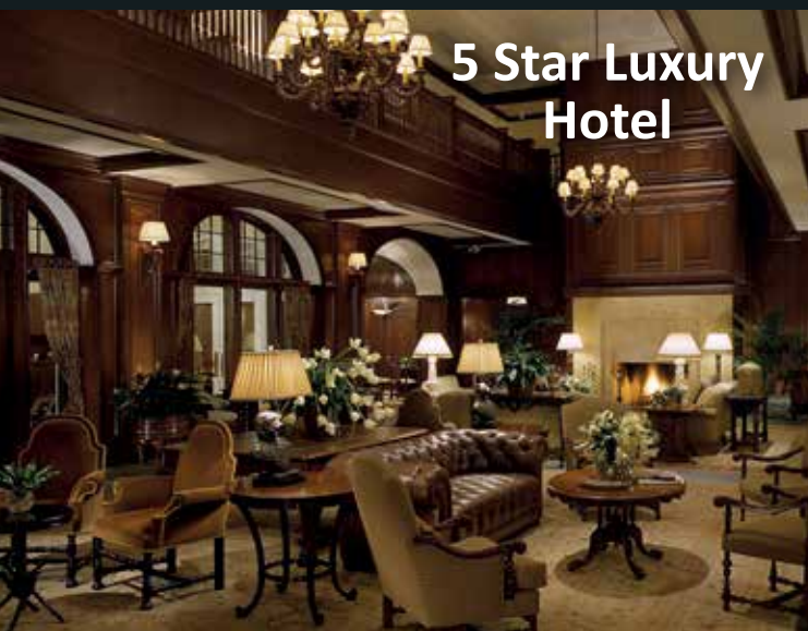
5 Star Luxury Hotel