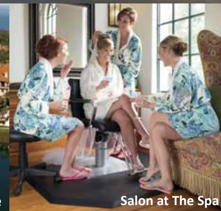
Salon at The Spa