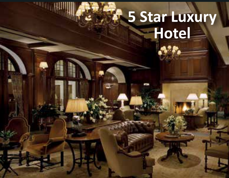
5 Star Luxury Hotel

Two dozen tournament professionals live, play and train on St. Simons and Sea Islands including Davis Love III, Zach Johnson, Matt Kuchar, Keith Mitchell and Brian Harman.