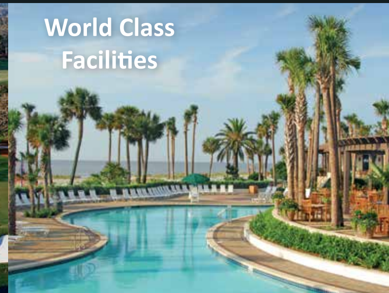
World Class Facilities