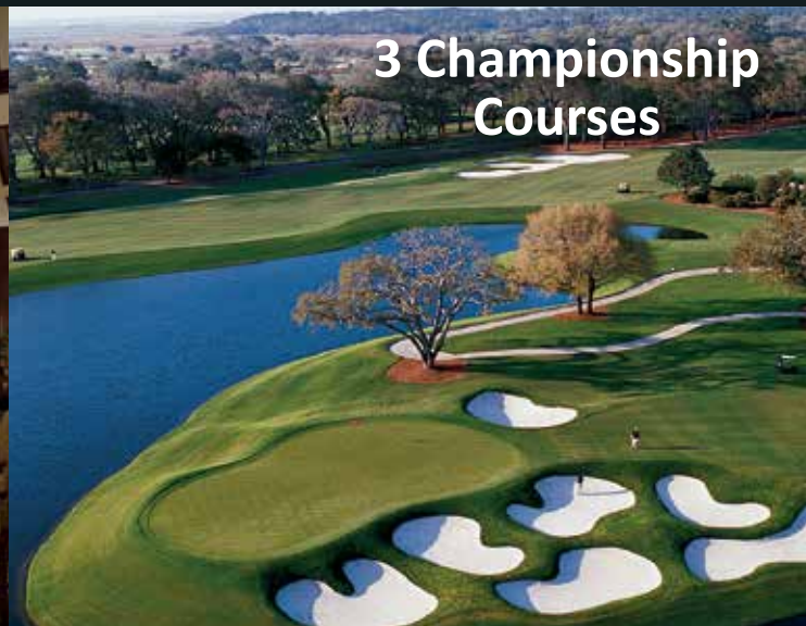
3 Championship Courses